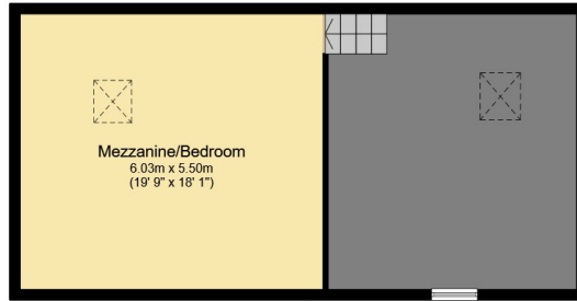
Mezzanine Floor area 60.9 sq.m. (656 sq.ft.)

Total floor area: 137.1 sq.m. (1,475 sq.ft.)